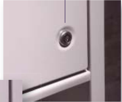
Sleek contemporary lock design.