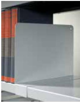
Book support full depth

If you work in a library, it is important that tasks can be carried out both efficiently and ergonomically. Our wide range of accessories ensures that all media can be stored in a well-organized manner.