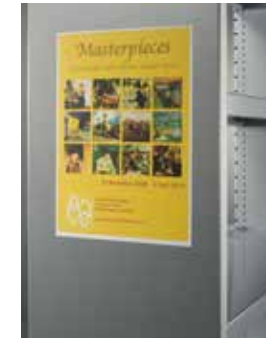
Label holder large