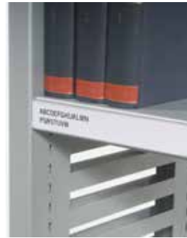
Shelf label- holder